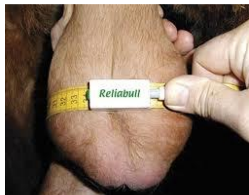
Figure 1. Measuring Scrotal Size.

Increased SS is associated with increased semen production in bulls, and earlier age at puberty of bull and heifer progeny. SS also has a small favourable relationship with Days to Calving (DC), such that bulls with larger SS tend to have daughters with shorter DC.